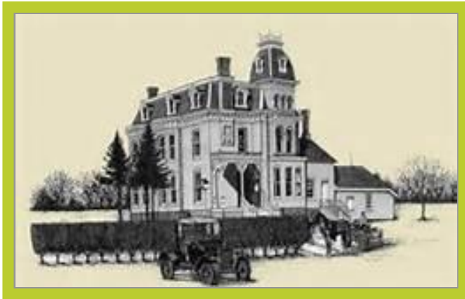
Roselawn Centre for the Living Arts