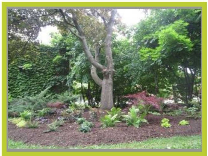
The Woodland Garden bed early planting - May 2014