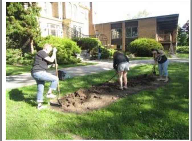
Members of the FoRC working hard at turning the Fragrance Garden bed in preparation for planting - May 2014