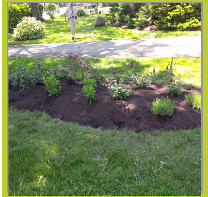
The Fragrance Garden bed early planting - May 2014